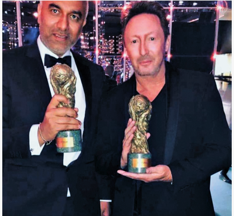
Julien Lennon receives a coveted Award from the Climate Change Forum