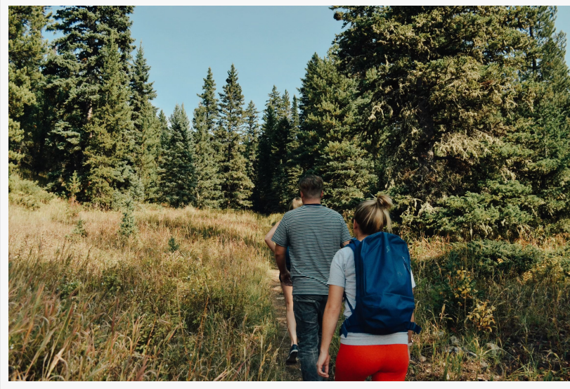
Team hike near Trail Creek, Montana

In an era dominated by virtual connections, Artisan Venture Tours emphasizes the profound impact of reconnecting face-to-face in a natural