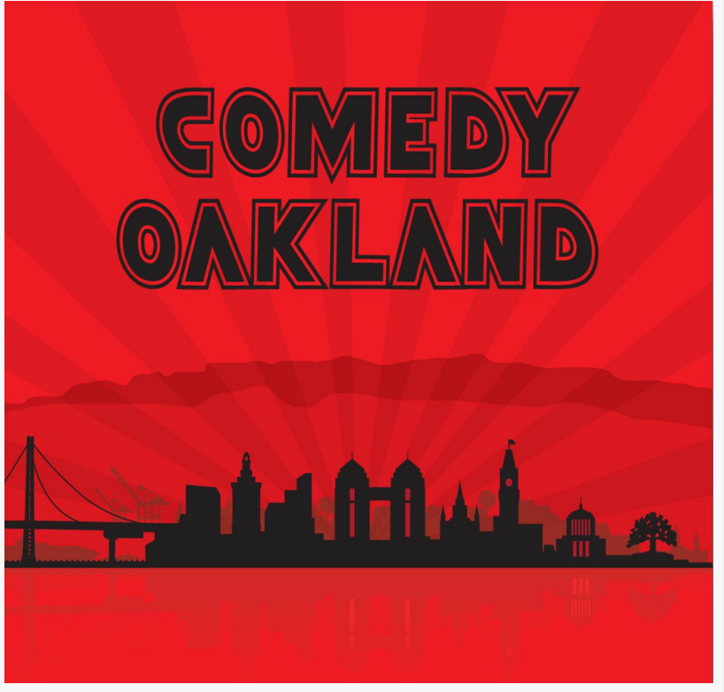
Comedy Oakland's Logo