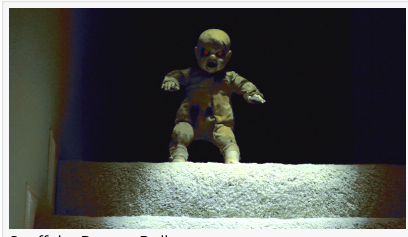
Snuff the Demon Doll

In the film, Emmy Award winning horror film favorite Bill Oberst, Jr. plays Grafton Torn—an amnesiac horror film writer for whom hypnotherapy and nightmares reveal terrifying images that just can't be real. Or can they? A