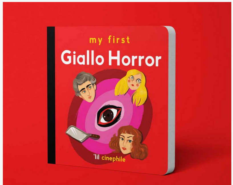
MY FIRST GIALLO HORROR Book