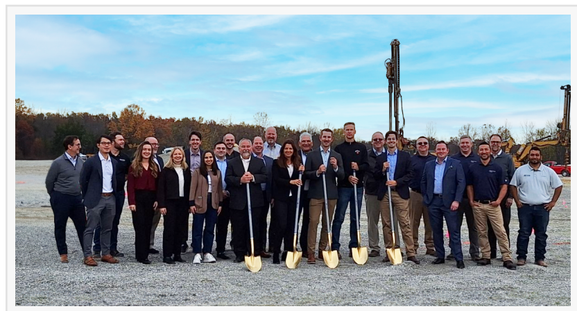
3 Rivers Energy Partners Honorary Groundbreaking in Boston Kentucky

BOSTON, KENTUCKY, UNITED STATES, November 8, 2023 /EINPresswire.com/ -- 3 Rivers Energy Partners held an honorary groundbreaking on a new sustainability project representing a milestone in the future of renewable energy. The 3 Rivers Energy Partners facility will utilize anaerobic digesters to process spent distillers grains from