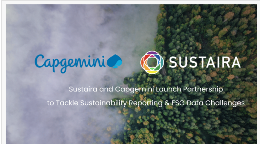
Sustaira and Capgemini launch partnership to tackle Sustainability Reporting & ESG data challenges

ROTTERDAM, THE NETHERLANDS, November 8, 2023 /EINPresswire.com/ -- Today, Sustaira , a leading provider of sustainability software solutions, announces its strategic partnership with Capgemini, a global leader in partnering with companies to unleash human energy through technology for an inclusive and sustainable future.