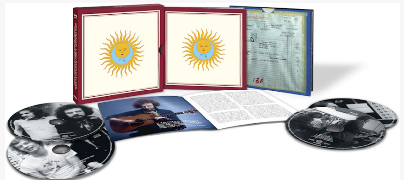
King Crimson - Larks' Tongues In Aspic (The Complete Recording Sessions)