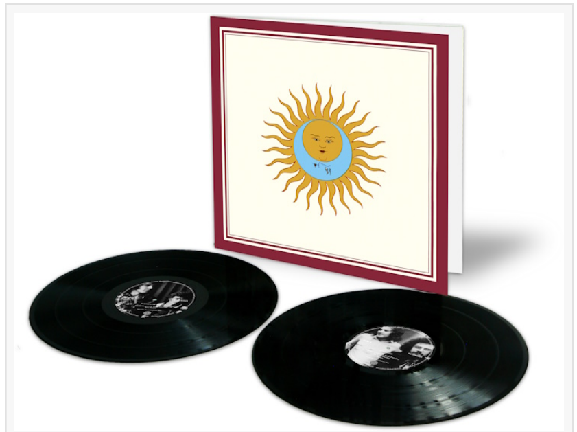
King Crimson - Larks' Tongues In Aspic (The Complete Recording Sessions)

The Atmos mixes allow a fresh glimpse of the vast scope of the individual material & performances as recorded for the album. The key to understanding this album, which Atmos illustrates most obviously, but is also present in all of Steven's new mixes, David's Elemental