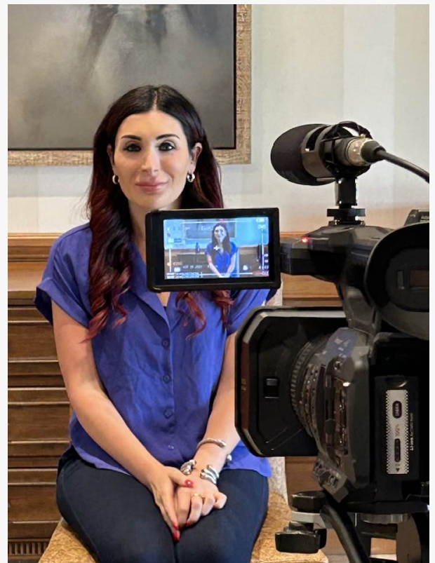
Laura Loomer filming for The Fall Of Deceit