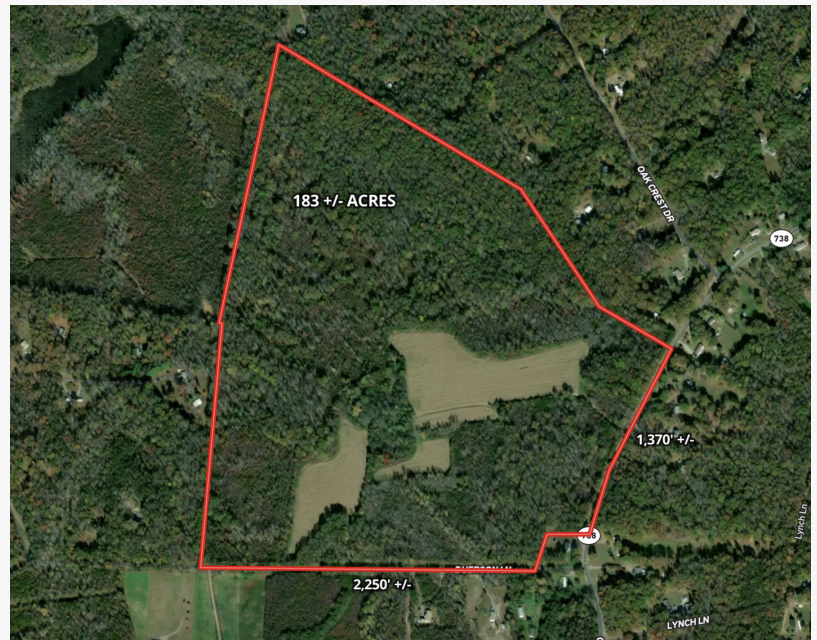
5304 Partlow Rd., Partlow, VA 22534 (Spotsylvania County)