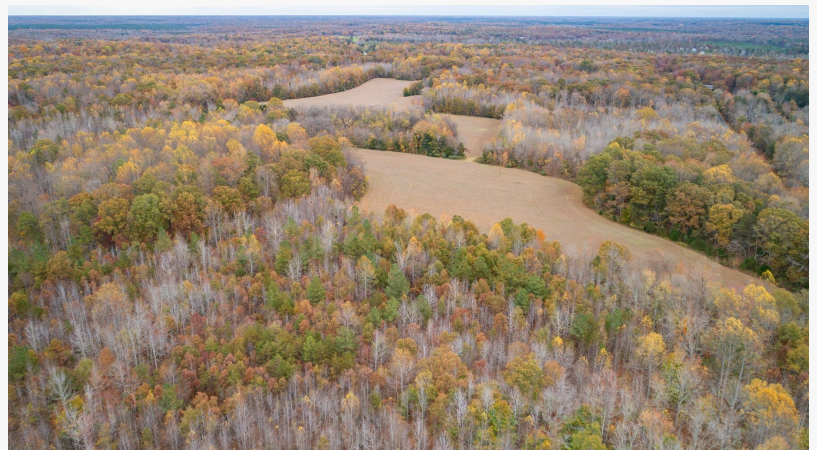
5304 Partlow Rd., Partlow, VA 22534 (Spotsylvania County)