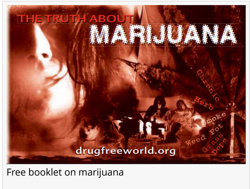
Free booklet on marijuana