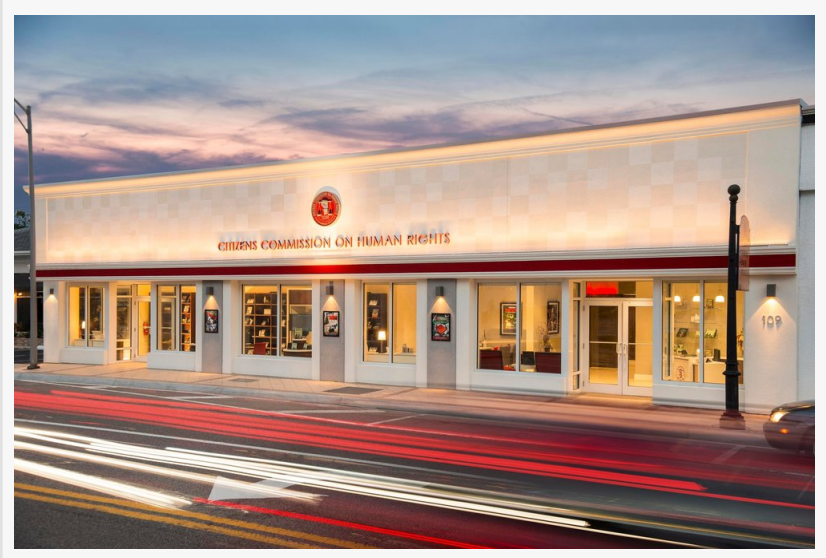
The headquarters for CCHR Florida are located in downtown Clearwater.

The mental health law, commonly referred to as the Baker Act in Florida, covers the use of involuntary examination and commitment. At the peak, this form of coercive psychiatry was used against Floridians 210,992 times in 2018.