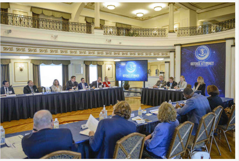
This webinar will be held on Wednesday, November 15th from 6:00pm-7:00pm via Zoom.