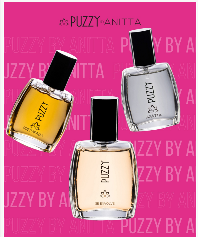
Puzzy by Anitta Perfume