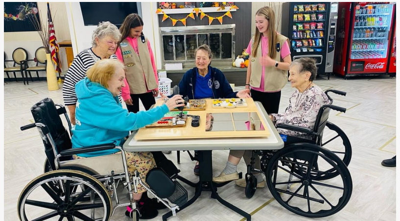
Residents of The Hamlet pictured with newly-created sensory boards provided by Troop 2843