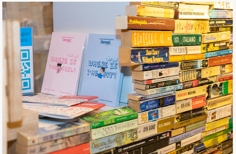
The counter made of book covers