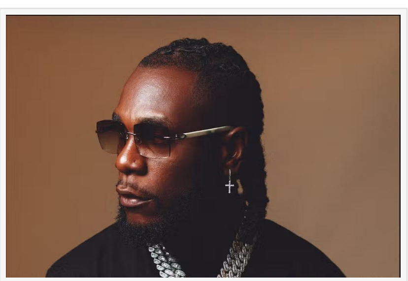
Grammy Award-winner Burna Boy to headline Spilligate's 'Festive Rhythms in Paradise', showcasing global Afro Fusion vibes.

MIAMI, FLORIDA, UNITED STATES, November 9, 2023 /EINPresswire.com/ -- As the holiday season approaches, the night sky over Nassau is poised to sparkle with Spilligate's "Festive Rhythms in Paradise," headlined by Afro Fusion sensation Burna Boy. This premier event, slated for December 16th, will showcase the dynamic beats of Burna Boy's international hits such as "Last Last," "Ye," and "It's Plenty." This eagerly anticipated event is expected to weave together the infectious charm of Bahamian