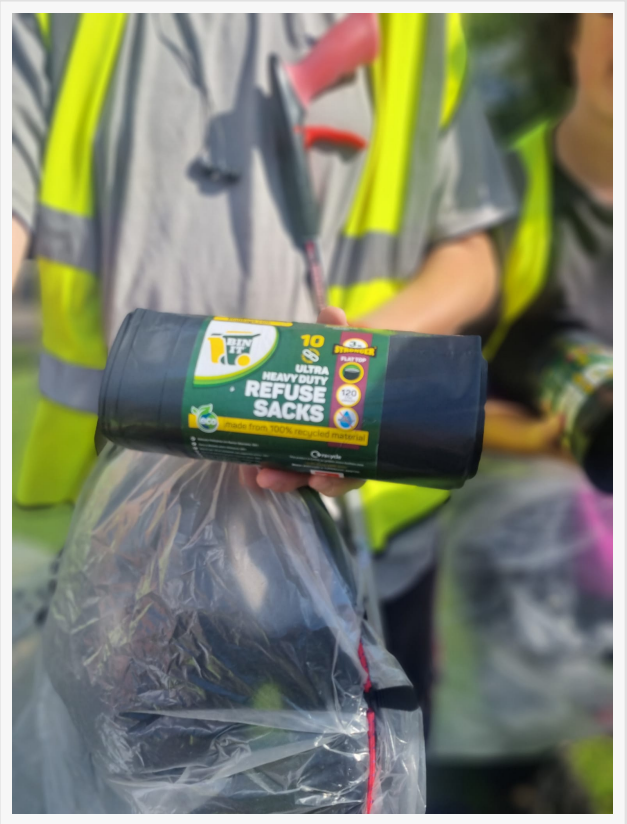
Litter picking with Binlt bags

In the midst of local government cuts, more and more communities are banding together to perform litter picking sessions in their local area. Last year, more than <u>430,000 volunteers</u>, including school children, faith groups, businesses and community groups, collected a staggering 449,406 bags of rubbish across the country. Many of these groups are self funded and supply their own bags for each litter pick, often having to choose quantity over quality.