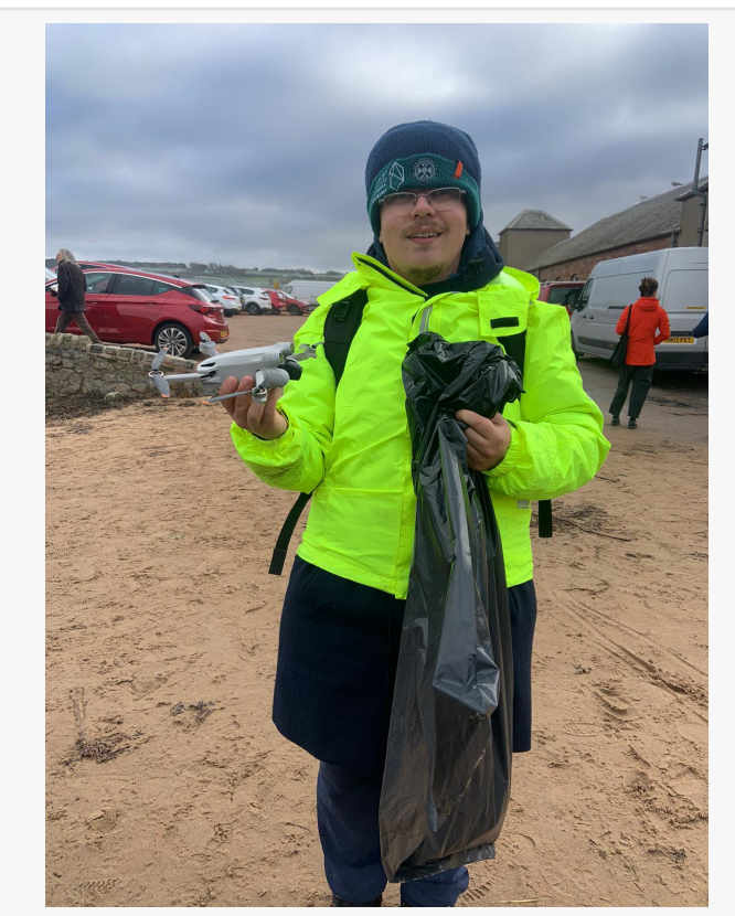
Beach Clean Transition St Andrews

All products are eco-friendly as can currently be. The entire range of bags is made of durable 100% recycled LDPE material. This material can be further recycled where facilities allow.