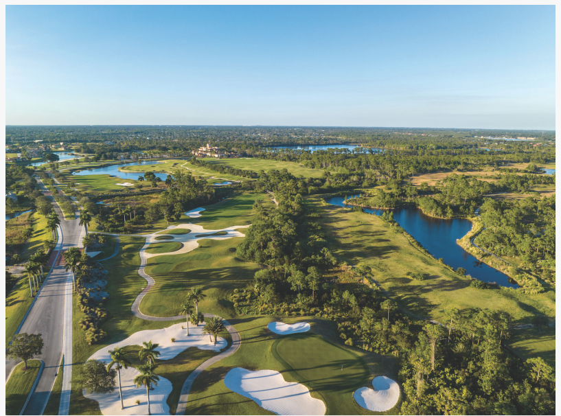
Tesoro Club's Championship Golf Course