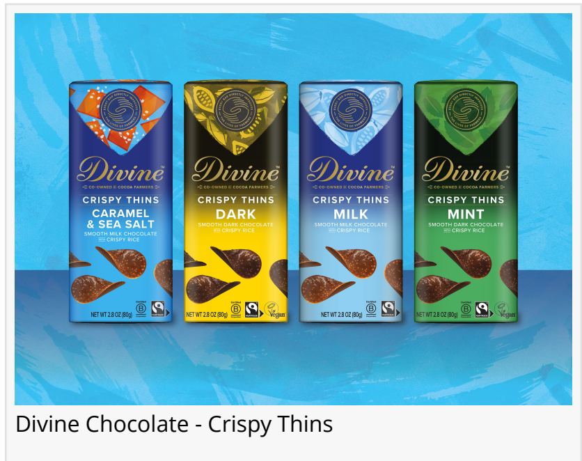
Divine Chocolate - Crispy Thins

Available for purchase nationwide as well as online shop at divinechocolateusa.com , offerings include snack bars, a baking collection, unsweetened cocoa powder, crispy thins, organic, mini-bar flights, and holiday editions including milk and dark chocolate advent calendars, and chocolate coins.