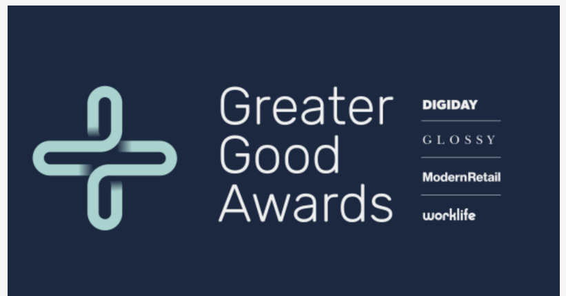
Greater Good Award For Animal Welfare Given to iHeartDogs.com

This year's winners, including iHeartDogs.com, share common values of purpose, innovation, and meaningful impact. iHeartDogs.com has been instrumental in rescuing shelter pets from overcrowding, promoting responsible pet ownership, and raising awareness about critical issues affecting animals. Their campaigns serve as poignant reminders of the power of meaningful causes that deeply resonate with audiences worldwide.