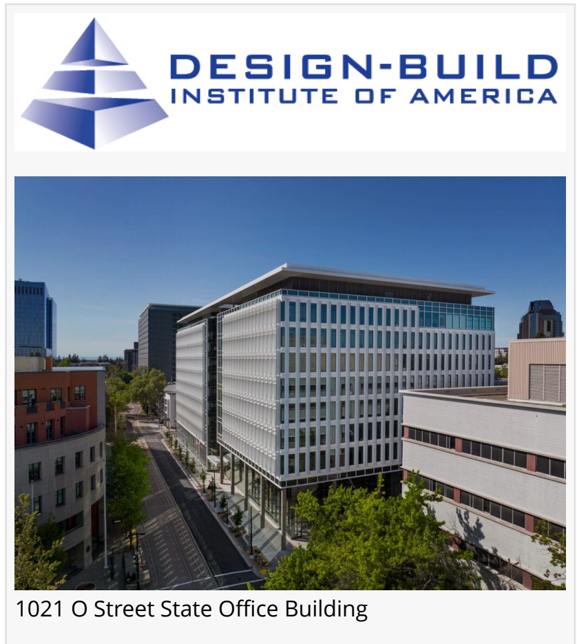
1021 O Street State Office Building

Best in Design -- Engineering: Silicon Valley Clean Water Gravity Pipeline Project