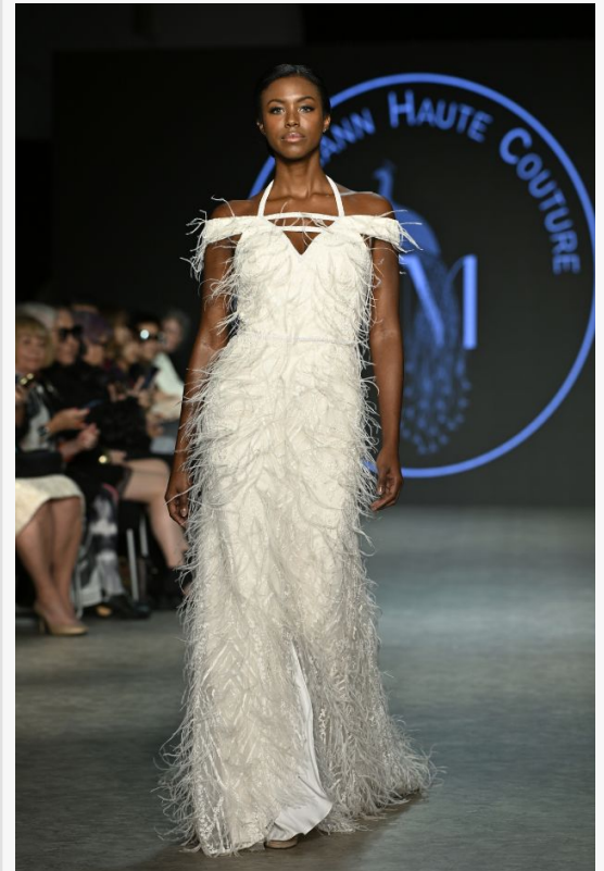
Photo by Arun Nevader at Vancouver Fashion Week. Tess Mann Haute Couture.

Vancouver Fashion Week is the fastest growing fashion week in the world and the only industry event that actively seeks out to showcase international award-winning designers from over 25