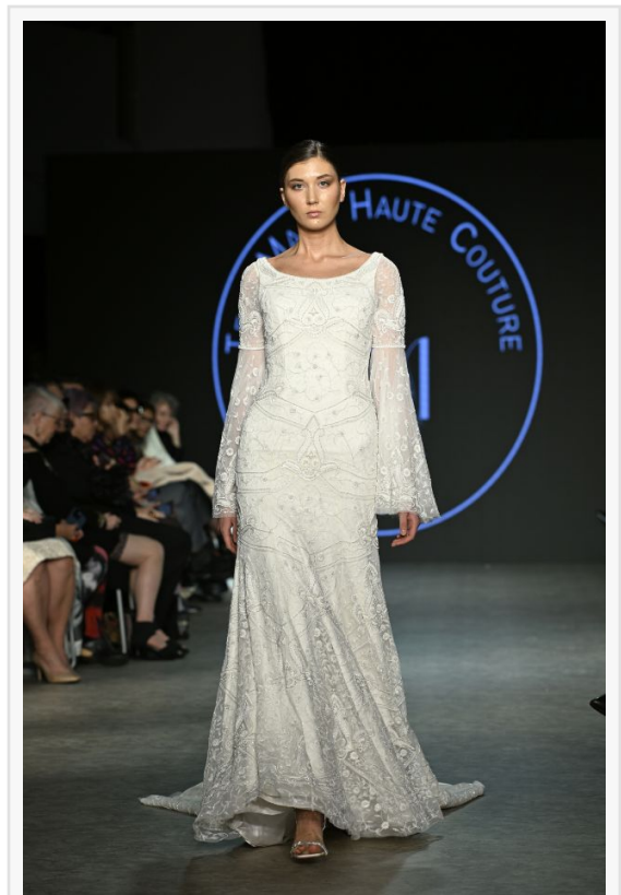
at Vancouver Fashion Week. Tess Mann Haute Couture.