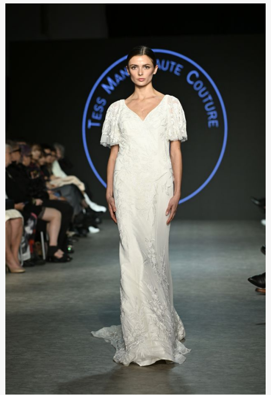
at Vancouver Fashion Week. Tess Mann Haute Couture.