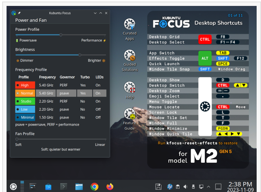
Kubuntu Focus Plasma 5.27 desktop with Hint widget

releases, bug reporting, and some bug fixes. The Focus team also integrated dozens of new Plasma capabilities to all past and current Focus models. Examples include updates to the Hints widget, refreshed themes, and integration to the power management system.