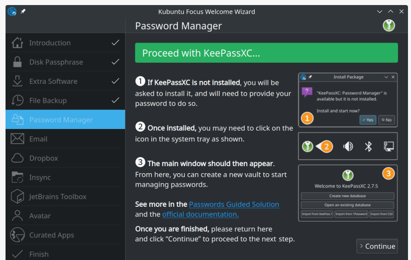
Kubuntu Focus Welcome Wizard