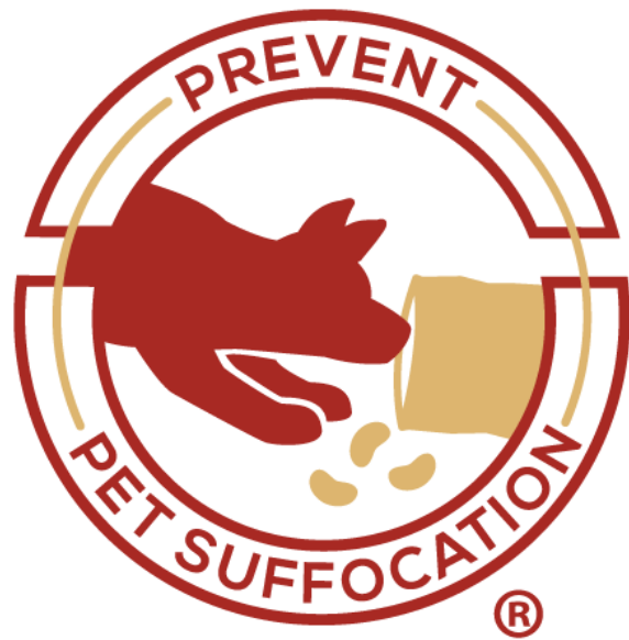
Prevent Pet Suffocation Logo

We can reduce the number of accidental pet deaths by educating the public on the dangers of these types of bags. Most people do not know that mylar bags are a suffocation hazard to their animals, and they often do not find out until it happens to their pet. Many pet owners have arrived home or walked into another room of the house and found their dog lying motionless with a chip bag or other type of bag over his snout or head. The more people are aware of this risk, the more pet owners can do to ensure their pet is safe. Awareness is our best defense against pet suffocation!