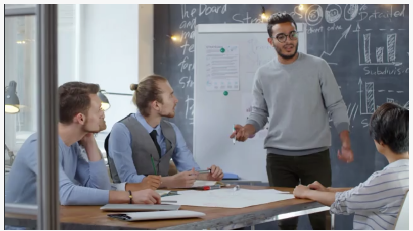
Group Health Insurance Dallas TX