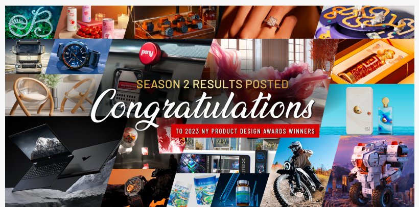
2023 NY Product Design Awards S2 Full Results Announced

EINPresswire.com/ -- The 2023 NY Product Design Awards has unveiled its full list of winners for the second competitive season of 2023, marking another year of groundbreaking innovations and design excellence. The celebrating outstanding product design innovators, and industry leaders from a