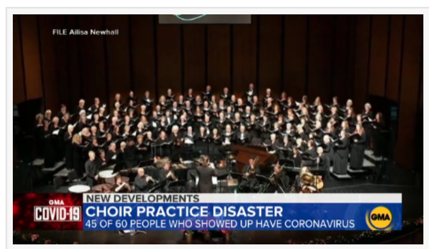
Choirs across the nation being affected by the COVID-19 pandemic.