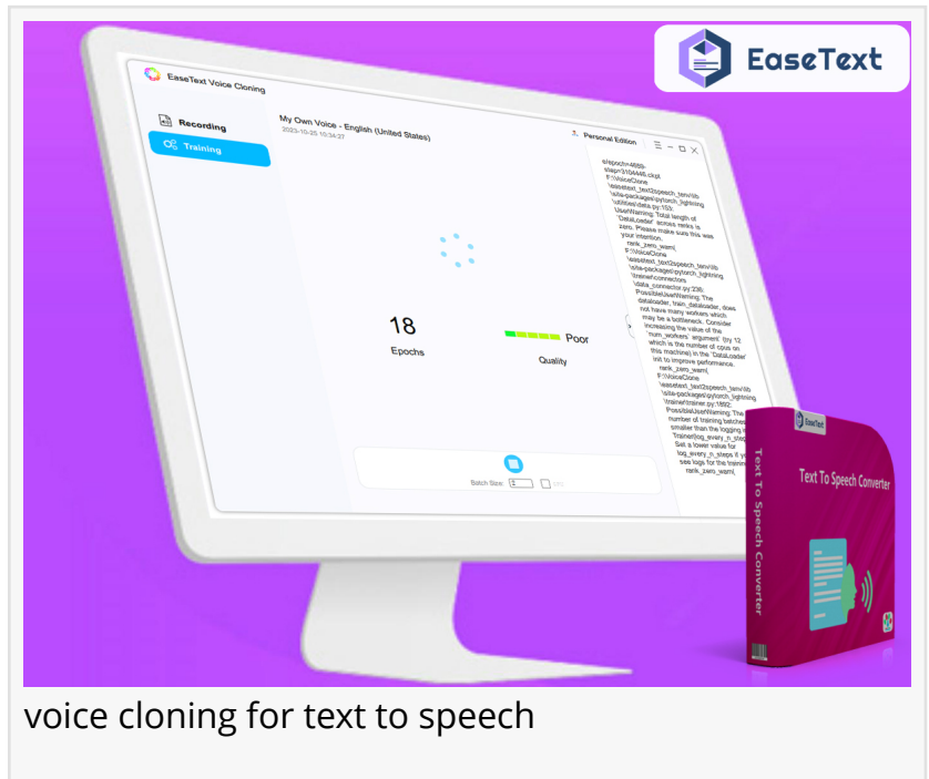
voice cloning for text to speech

SAN FRANCISCO, CALIFORNIA, UNITED STATES, November 13, 2023 /EINPresswire.com/ -- EaseText, a trailblazer in text-to-speech innovation, announces a significant leap forward with the introduction of Voice Cloning in its flagship software - EaseText Text to Speech Converter . This breakthrough feature not only transforms text into natural and lifelike speech but also empowers users to create and integrate personalized voices.