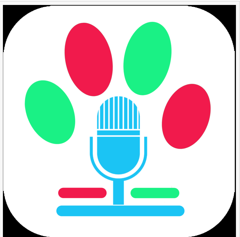
EaseText Text to Speech Converter

For personal 1 computer usage, it is available at $3.95 /month. Users also can buy the Family