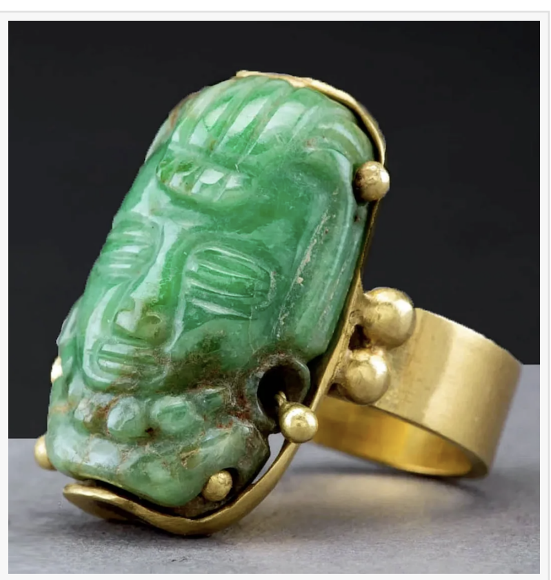
Gold ring with Maya jade pendant depicting maize god, Pre-Columbian, Southern Mexico to Guatemala, Classic Period, circa 300-500 AD. Estimate: $10,000-$15,000

Artemis Gallery's fastest growing category, Fine & Visual Art, brings fresh selections to the marketplace, with most consignments coming from the