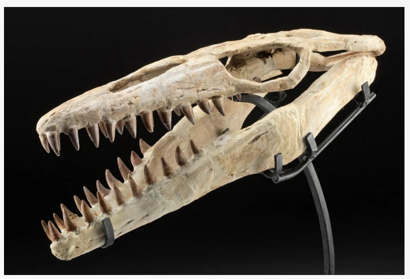
Full skull and jaws of prehistoric marine reptile Prognathodon mosasaur, Maastrichtian era (late Cretaceous), circa 83.6 to 66 million years ago. Estimate: $18,000-$25,000

Native American art highlights include a rare circa-1920s Maria Martinez (San Ildefonso Pueblo, 1887-1980) lidded blackware box. It is signed simply "Maria" in cursive to the underside, a style employed by the artist on only her earliest works. Measuring 5.25 inches long by 4.125 inches wide by 5 inches high, the vessel exhibits an intense luster with matte decoration. Although it appears to be etched, the decoration was actually applied via a matte slip over the heavily