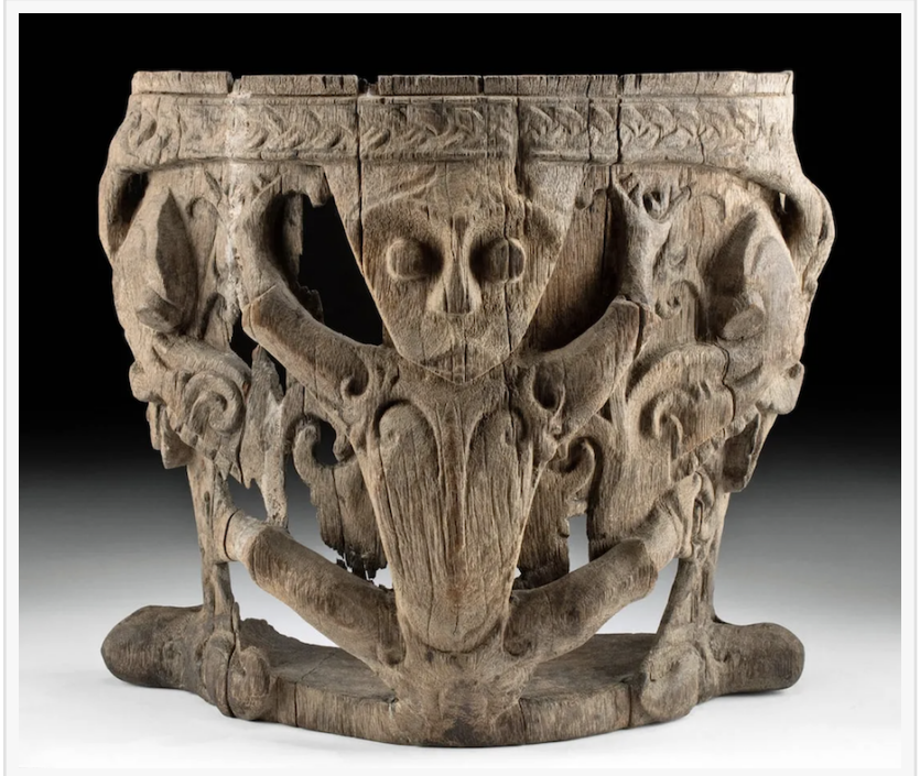
Circa-16th-century CE Indonesian/Dayak peoples wood baby carrier with carved guardians, C-14 radiocarbon dated. Estimate $35,000-$45,000

A most extraordinary circa-16thcentury CE Indonesian/Dayak peoples wood baby carrier is formed in a halfbasket shape with a crescent seat and holes and carved loops for attaching the carrier to the mother's back like a backpack. It is adorned with carved, full-figured guardians to protect the carried baby from evil. Such fully detailed figures were reserved for the highest societal classes. C-14 radiocarbon dating confirmed that the piece is ancient and of the period stated. The relevant report will convey to the winning bidder. Formerly in a Hawaii private collection, it will cross the auction block with a $35,000-$45,000 estimate.