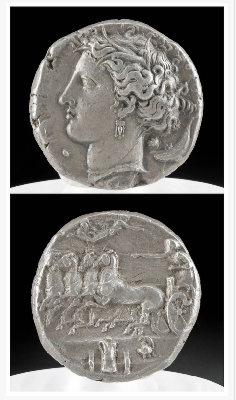
Sicily, Syracuse AR (silver) decadrachm/decadrachm, Time of Dionysios I, circa 405-370 BC. Style of Euainetos, with charioteer. Estimate: $40,000-$60,000

At around the same time the Imperial Roman Empire was at its peak, the ancient Indo-Aryan civilization known as Gandhara was beginning its rapid ascent under the Kushan Empire. Gandhara flourished at the crossroads of India, Central Asia