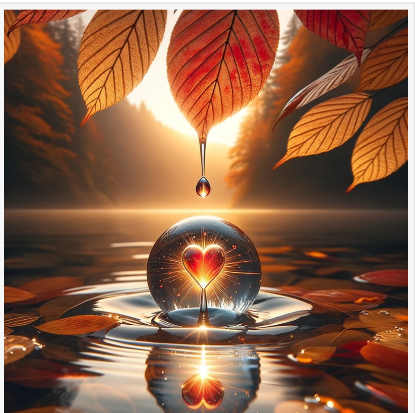
Love Drops Illustration

On January 1, 2024, the Love Drops Global Map will debut on LoveDrops.org. This interactive display will showcase Love Drops shared worldwide, serving as a testament to our shared humanity and inspiring further acts of love and kindness.