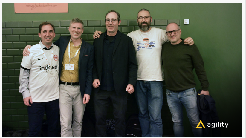
Feature Award Winners

This press release can be viewed online at: https://www.einpresswire.com/article/668222186