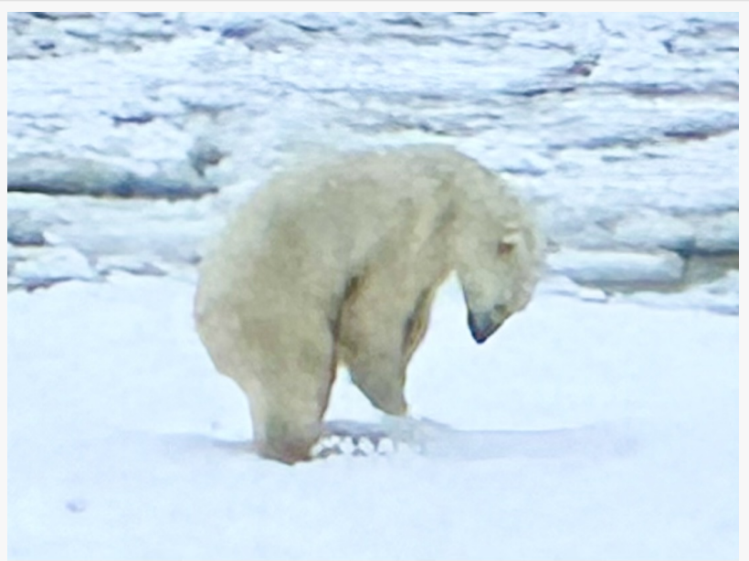
Male polar bear who hasn’t eaten in 145 days jumps on sea ice on Hudson Bay in Churchill, Manitoba Canada, to see if it will hold him. It doesn’t.

Why should humans care? Arctic sea ice is important for humans. It reflects sunlight and keeps worldwide temperatures down. It’s the earth’s “air conditioner.”