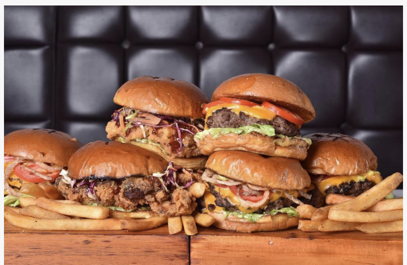
Juicy Burgers and Tasty Sandwiches

"We wanted to create a burger experience that goes beyond expectations," said Chef Todd English. "Pound Burger combines the juiciest, most flavorful meat with high-quality ingredients and bold flavors. Our aim is to provide a memorable dining experience for burger enthusiasts who appreciate the art of great food."