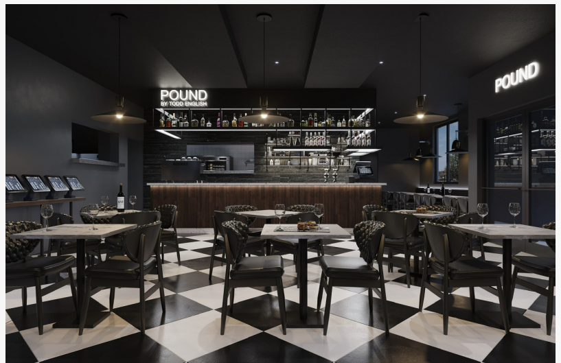
Pound by Todd English - Carrollton, Texas