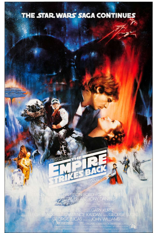
Empire Strikes Back (1985) poster valued at $15,000 - $20,000

Over 700 rare and iconic lots will be sold during Propstore's unique Collectible Posters Auction. Registration and bidding is now open at https://propstoreauction.com/auctions/info/id/391 . Bids will be accepted online through December 7 & 8, 2023.