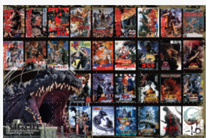
Acrylic block design

create an experience that can only be had in Awaji Island. Unique collaboration rooms themed on popular characters such as "Crayon Shin-chan", "Hello Kitty", "Naruto", and "Dragon Quest" are also available.