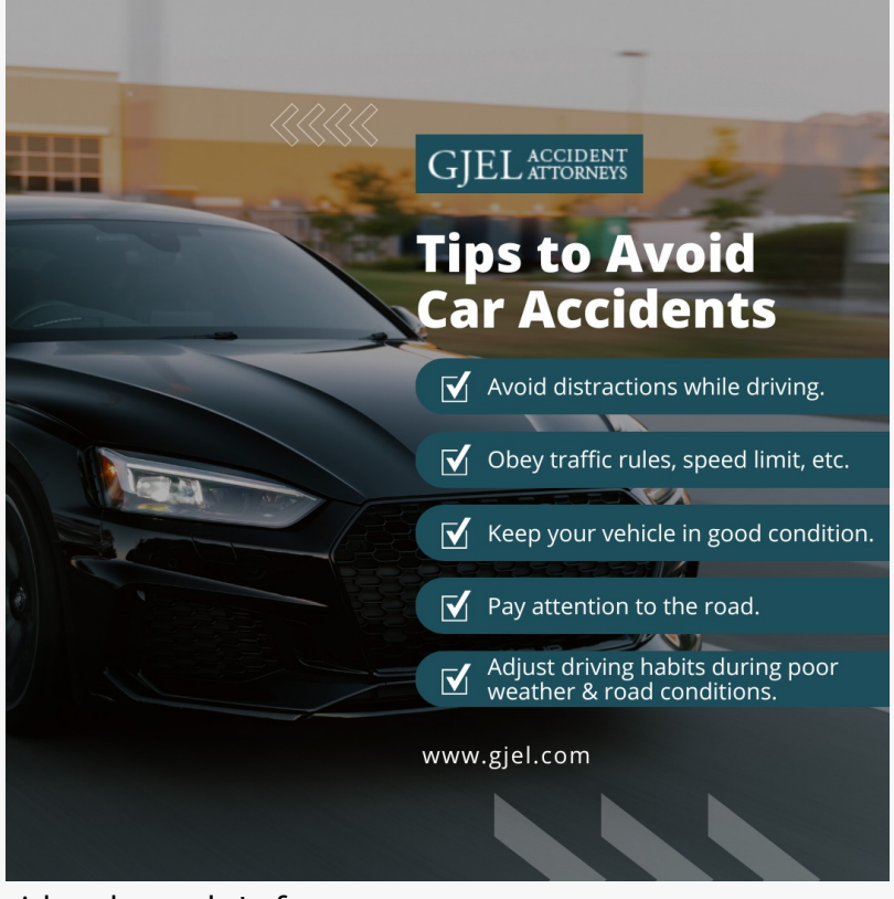
rides through Lyft