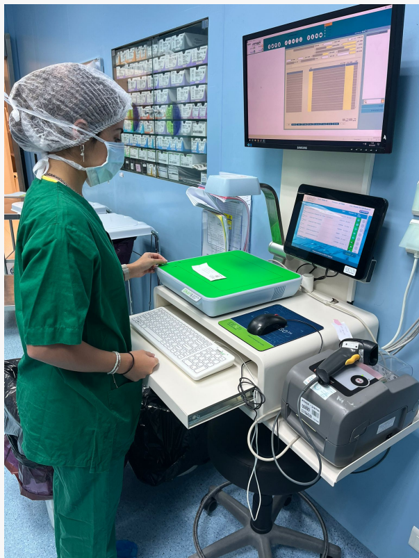
Nurse using Snap&Go computer sensor to document surgical supply utilization