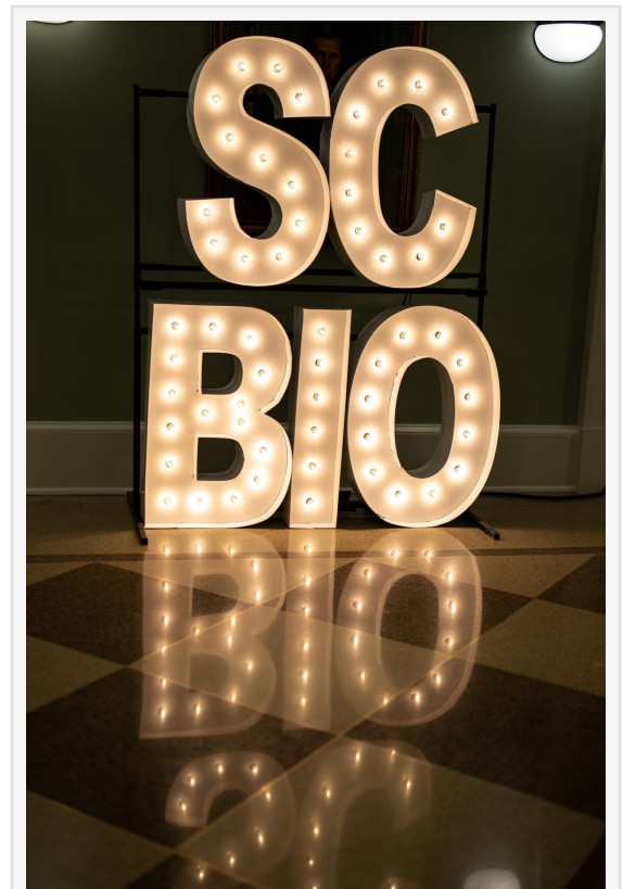
SCbio 2024 Conference comes to Greenville, SC Feb 6-8