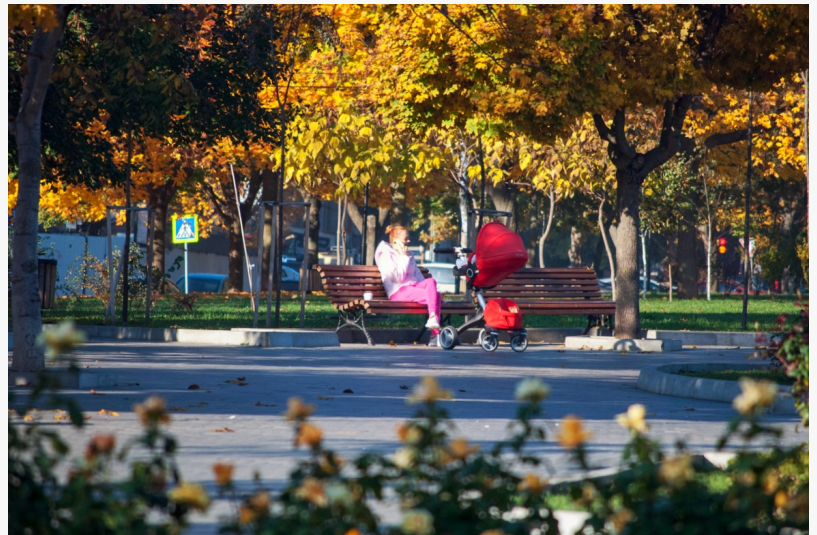
Labor market in Moldova

The second reason why people lose interest in a job offer is because of an inconvenient timetable. More than 60% of poll participants mentioned this reason. In addition, for every second participant it is important that the office or company is as close as possible to home. Women indicated this aspect more often than men.