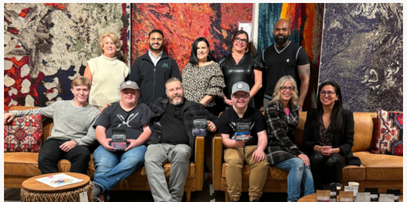
Unique Loom x HÆRFEST Coffee Co collaborate on a new rug collection that pairs artists with abilities.

HÆRFEST (pronounced “harvest” from an Old English variant) is a coffee outreach company that utilizes the HÆRFEST of coffee to impact lives and create positive change.