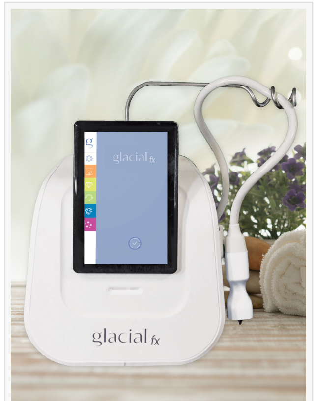
Glacial fx by R2 Technologies system image

R2 is also pleased to launch two new product enhancements to help fight inflammation: a larger-sized disposable treatment tip and a colder advanced clinical protocol for the Glacial Glide treatment modality, known as Glacial® Glide Rx. The larger treatment tip allows clinicians to optimize skin contact and down-regulate inflammation in larger surface areas, such as the back or chest while delivering excellent results in less time. The advanced Glacial Glide Rx protocol leverages a recent FDA clearance for colder temperatures, ensuring unparalleled precision and patient comfort. These innovations will provide greater treatment utility for providers and improve patient experience and outcomes, making the Glacial product portfolio an emerging standard of care. "The Glacial Skin system is the best facial device on the market! It provides many options, such as calming and rejuvenation, exfoliation, and even benign lesion removal", says Dr. Jason Emer, Cosmetic Dermatologist. "With the right protocols, it gives the best radiance we have ever seen in any facial device, plus redness, swelling and puffiness are reduced instantly. Our patients immediately see the glow and improved skin barrier."