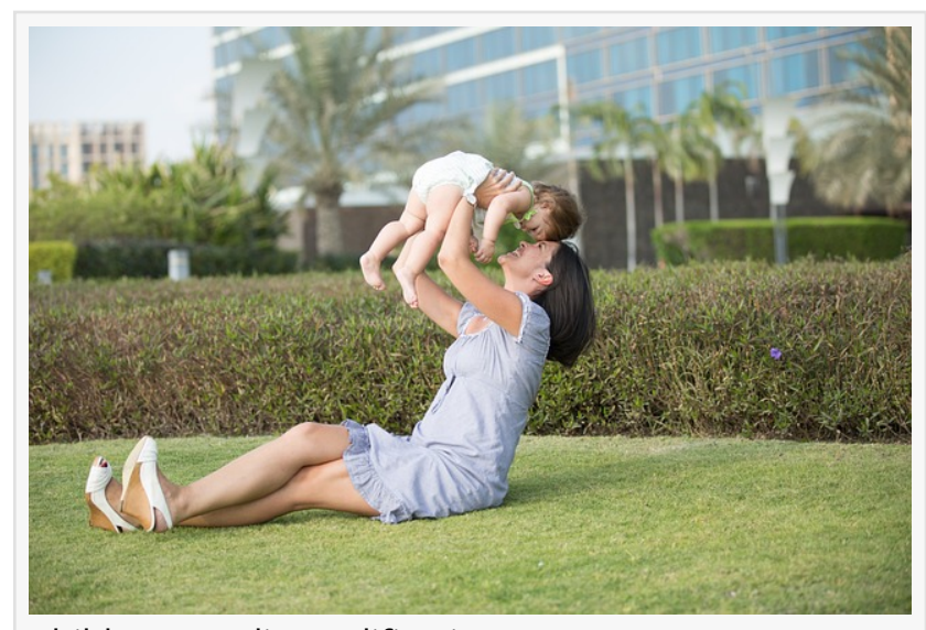
Child Tax Credit Qualifications

Explore Electronic Filing Options: Electronic filing, such as e-file, provides a faster and more secure way to submit applications for the Child Tax Credit. Taxpayers can benefit from quicker processing times and receive their credits more expeditiously by choosing electronic filing options.