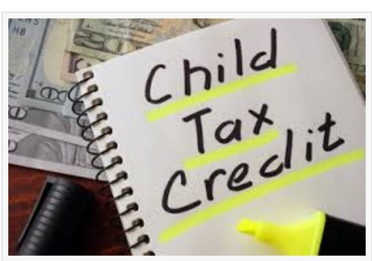
Apply for Child Tax Credit

Familiarize Yourself with Eligibility Criteria: Before applying for the Child Tax Credit, it is essential to understand the eligibility criteria. The IRS provides comprehensive information on its official website, detailing