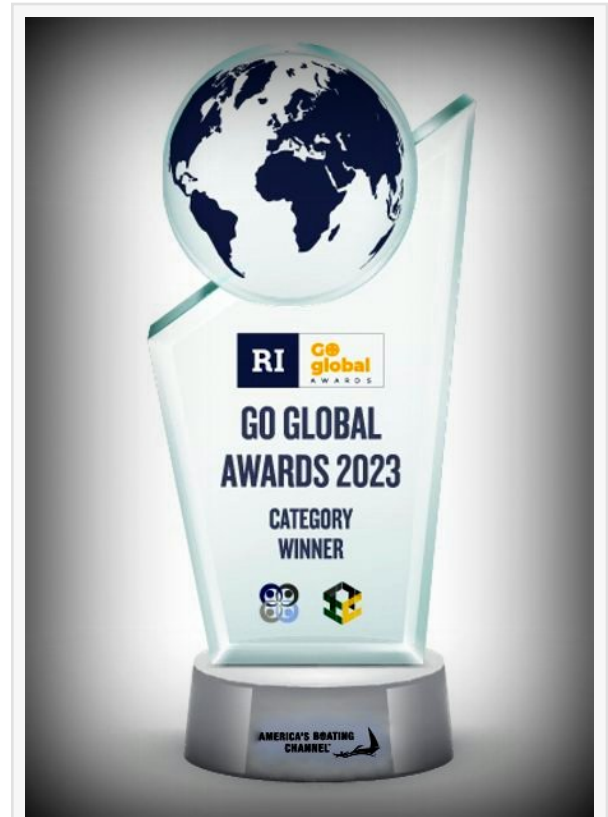
Maritime Services Award Trophy

This award follows America's Boating Channel's remarkable accomplishments during the past year during which it launched a new flagship television offering at the International Boating & Water Safety Summit (IBWSS). From its IBWSS launch, the service's BOATING NEWS category has featured global coverage of breaking stories; and its BOAT RACES category has included power boat races from around the world. The leading European maritime training organization Seably built an online educational curriculum around the service's safety videos. WATER WAYS TV, a program series on recreational boating across Canada has been added to the service. BORDER CROSSING, a video providing guidance to US boaters traveling overseas, has been produced and released by America's Boating Channel. Spanish translations of the service's basic boat operation videos have been incorporated in its television offering. The Caribbean Broadcast Network (CBN) now rotates America's Boating Channel's videos as public service announcements (PSAs) during newscasts on TV stations throughout the islands. More than forty percent (40+%) of America's Boating Channel's audience is comprised of international viewers.