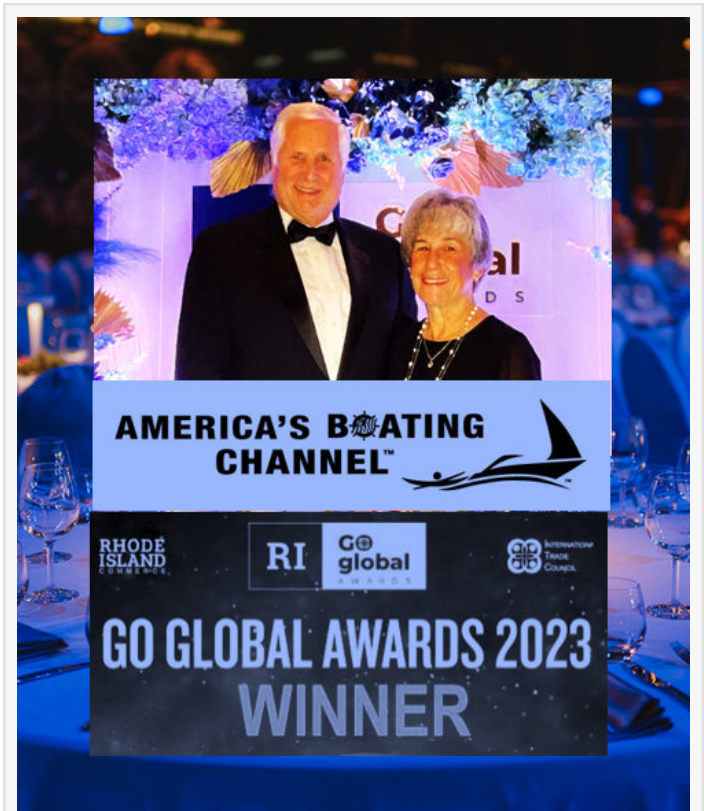
2023 Go Global Award Winner

America's Boating Channel's Achievements