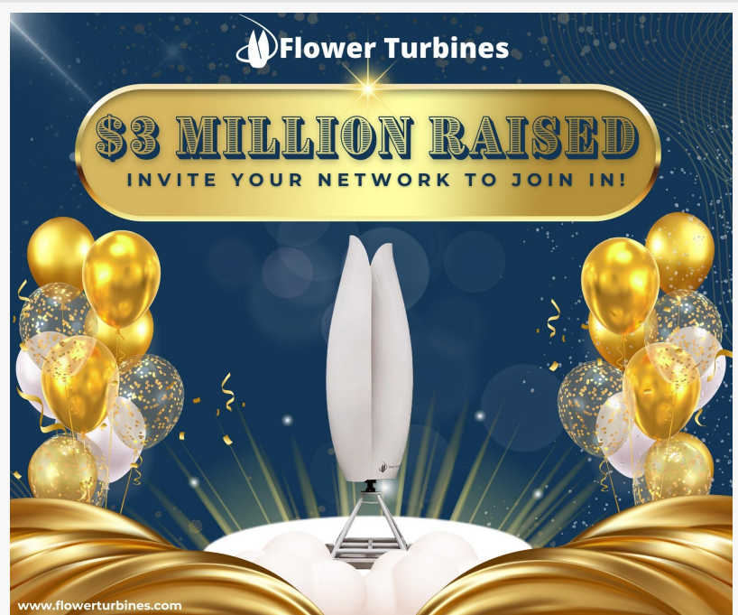
Flower Turbines Raises $3 Million

Flower Turbines is a US company with an important branch in the EU that has the goal of making small wind as powerful a force in renewable energy as solar by using its multiple patents to create a wind turbine that meets all the needs of urban and suburban environments. It combines aerodynamic innovations with