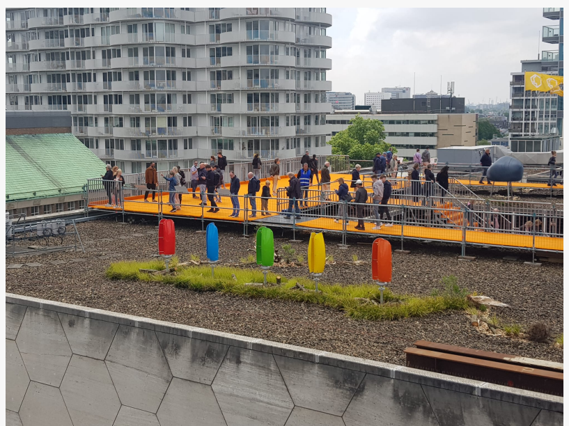
Flower Turbines at Rotterdam Roof Days

- Winner of the Dutch government sustainability award for two separate years.