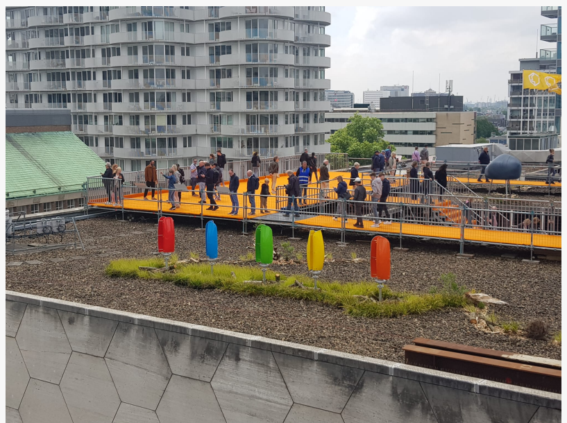
Flower Turbines at Rotterdam Roof Days

Disclaimer: Investors should read the Offering Circular ( http://alturl.com/wpfpfpr ) and Risks ( http://alturl.com/8hrbw ) related to this offering before investing. This Reg A+ offering is made available through StartEngine Primary, LLC, member FINRA/SIPC. This investment is speculative,