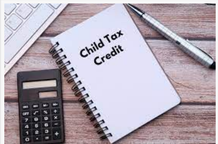
Child Tax Credit Amount

By providing financial assistance to families