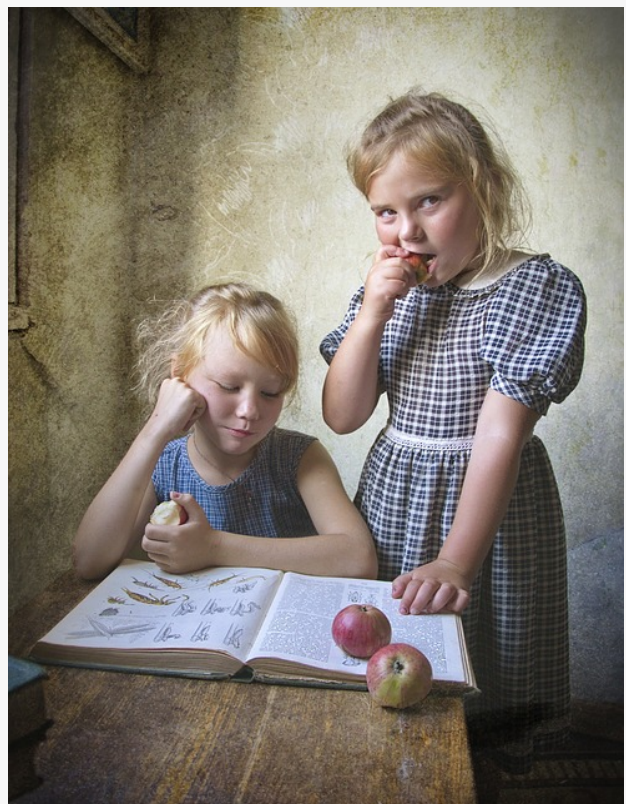
Child Tax Credit Update