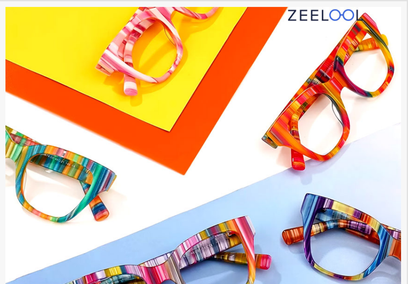
Zeelool Nereyda Candy Glasses

Wearing different styles of eyeglasses is a way to express one's uniqueness, and the Zeelool Nereyda candy frame glasses collection is unique and versatile as a women's fashion statement piece, suitable for all skin tones, face shapes, and ages. Frames that make a statement and encourage people to embrace their uniqueness