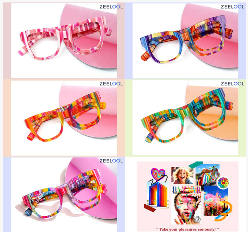
Zeelool Nereyda Candy Frames Glasses