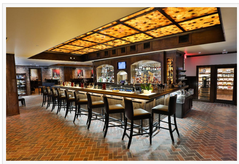
Red Phone Booth Bar

MIAMI, FLORIDA, UNITED STATES, November 15, 2023 / EINPresswire.com/ -- Red Phone Booth, a true 1920's Prohibition Experience, has announced new dates for their Grand Opening in Miami's Brickell neighborhood at 1010 Brickell Ave, Suite 500, Miami, FL 33131. Grand Opening Events are now slated for December 8th and 9th (by invitation only). The public is welcome to attend the Grand Opening events after