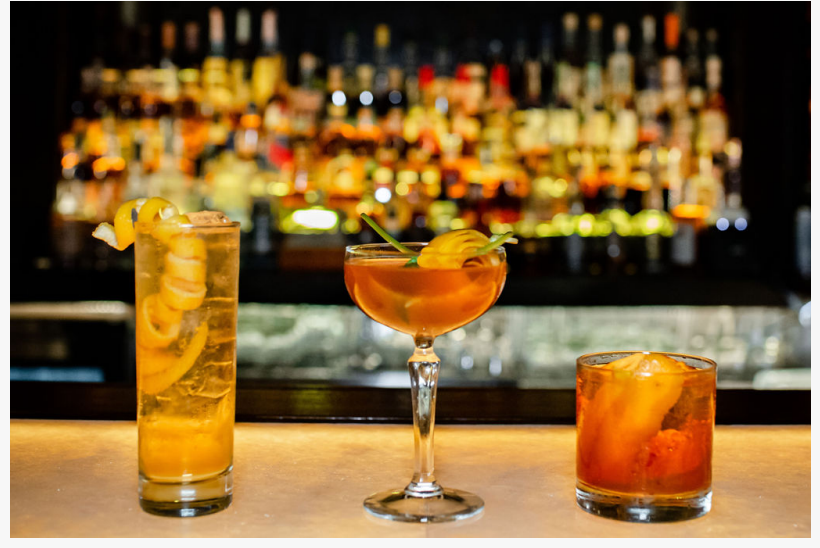
Craft Cocktails by Order

Red Phone Booth patrons will enjoy exceptional Italian inspired appetizers and small bites menu