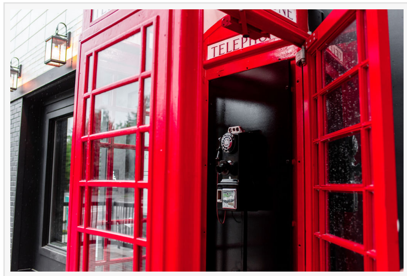
Red Phone Booth Entry

Red Phone Booth offers a world-class mixology program curated by an expert team of bartenders. Patrons can expect a cocktail menu featuring an extensive selection of over 400 spirits including rare bourbon, whiskey, scotch, tequila and Japanese whisky selections. Patrons will notice the finest attention to detail that provides for exceptional cocktails including 100% fresh squeezed juices to include lemon, lime, orange, pineapple and cranberry juices and hand chipped doublereverse pass osmosis ice, garnishes cut to order, a collection of some of the rarest liquors available and over a dozen tinctures, bitters and flavoring agents to help breathe new depth. Red Phone Booth is known for its exclusive member tasting events where members sample flights of whiskey, bourbon, scotch or tequila and learn the spirits' history from key leaders in the industry.