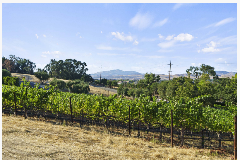
Boutique winery producing 95-point rated wines

surrounded by vineyards. Though the Tri-Valley region is fast-growing, Pleasanton retains a small-town feel. The town has been named one of the best places to live in Money magazine, where you can enjoy art, dining, culture, and winery hopping. With more than 1,200 acres of public parks and green space, Pleasanton is also a beautiful place to explore on foot or by two wheels. From Del Valle and Pleasanton Ridge regional parks to Mount Diablo, there's no shortage of picturesque spots to hike, bike, swim, fish, and enjoy the great outdoors. The