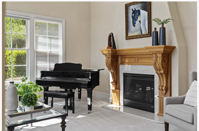
Exclusive Bordeaux Estates