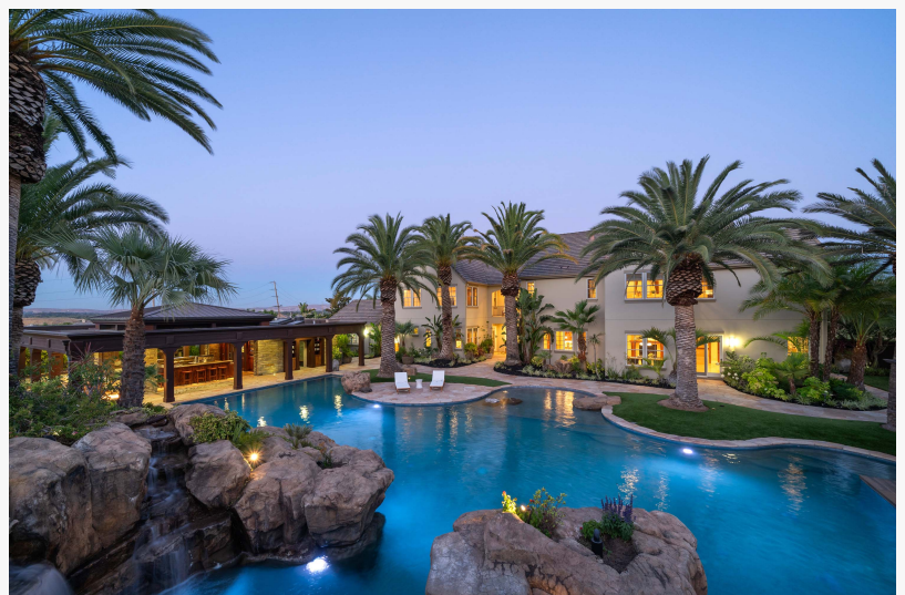
Resort-style pool and outdoor entertaining pavilion