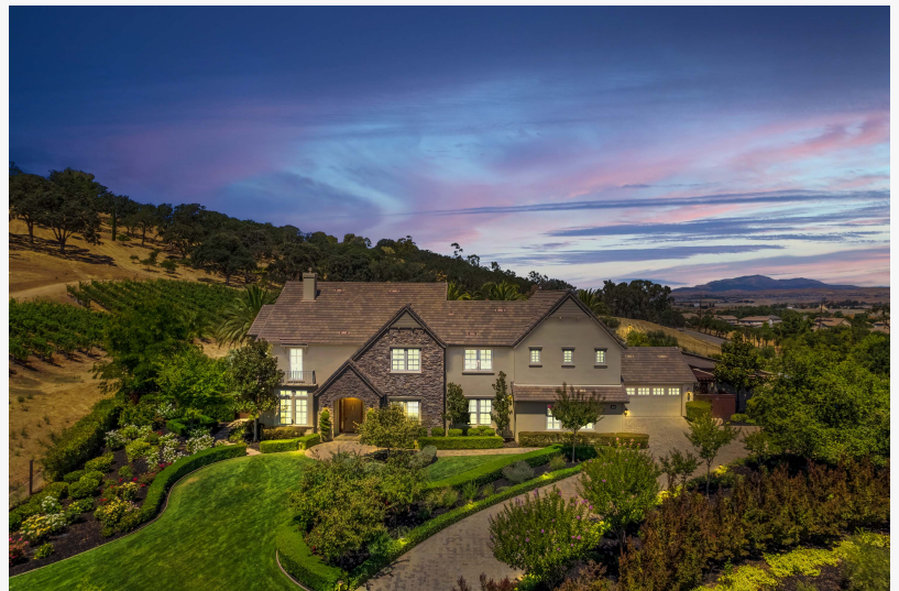
14-acre vineyard estate with potential revenues