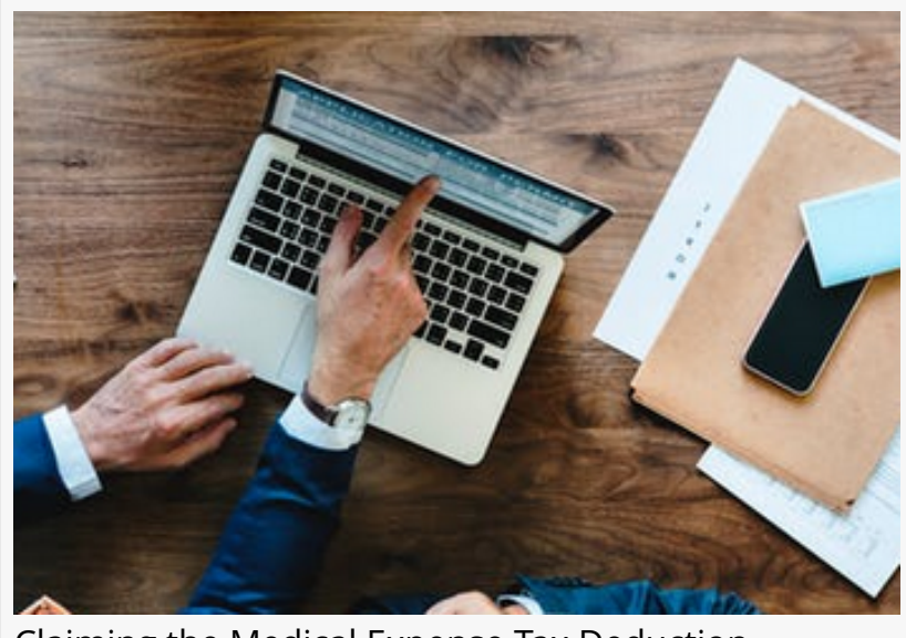
Claiming the Medical Expense Tax Deduction

The IRS allows all taxpayers to deduct their total qualified unreimbursed medical care expenses that exceed 7.5% of their adjusted gross income It's important to note that the new limit applies only to taxpayers who itemize their deductions.